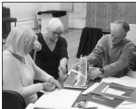
Mounting Exhibition Photos

At the other end of the hall we had a chance to photograph the blade of a very fine antique Japanese sword, kindly brought in by the friend of a club member. The subtle wavy patterns in the steel were a real challenge to