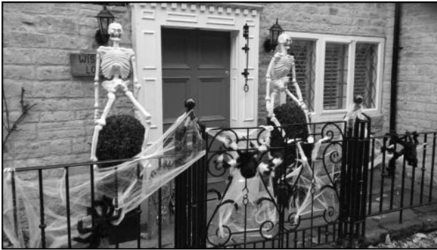
A Church Street house ready for Halloween

By the time you read this, villagers will have celebrated Halloween and the Guy Fawkes bonfire and fireworks – hopefully in better weather than the Victorian Street Fayre! We now look forward to all the festive activities such as the Harbury Christmas Fayre and the Ladbroke Christmas Party.