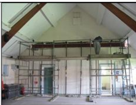
RSJs manoeuvred into place

One of the first stages needed for the extension is the removal of a section of the end wall, so that two RSJ's (reinforced steel joists, in 'builder-speak') can be inserted to provide the strength to support the wall above the level of the proscenium arch. This is essential, as the majority of the wall will be removed to make the opening for the stage area, which will project above floor level so that storage space will be provided underneath for theatre group props etc. Although the work proceeding internally e.g. demolition of the out-dated shower and toilet facilities may not be obvious to villagers who do not use the hall on a regular basis, the external work to produce the initial secure 'building envelope' will doubtless be observed with fascination by all passers-by?