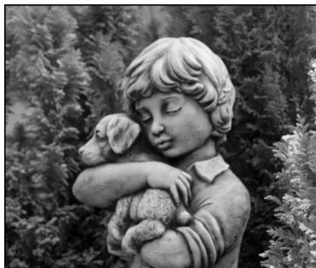
Composition by Alan Knowles

Members showed how they had made their pictures more interesting. Catching the moment when a puppy snuggles into someone's arm or when two dray horses are looking at their groom (who, incidentally, was feeding them beer!) Using a wide aperture to focus on some flowers and blur the rest. Avoiding a fussy background to a statue (difficult when someone has built a magnificent hotel right behind it!) Or framing the image to bring out the best features, as Alan Knowles did with this statuette in his garden.