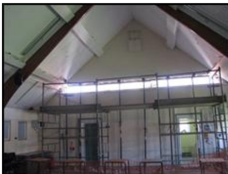
End wall with section removed for RSJs

Unfortunately, as with many 1960's buildings, asbestos has been discovered in various parts of the original construction and this will have to be removed before building can commence safely. All stages of the on-going construction work will be carefully monitored and it is not anticipated that there will be too much disruption to the use of the hall. If any of the hirers encounter a problem at any time in the coming weeks, they are asked to contact one of the committee members whose details are listed in the display case outside the main entrance.