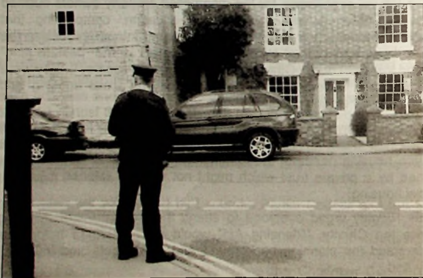
The Parking Enforcement Officer on Patrol