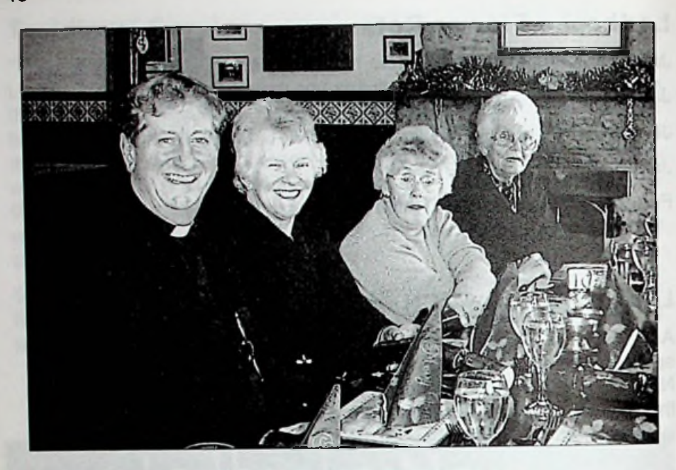
Christmas lunch at The Fox and Hen

Do not forget our invitation to join in the festivities with the Harbury Mother's Union on January 5<sup>th</sup>. Bring a small gift for the bran tub.