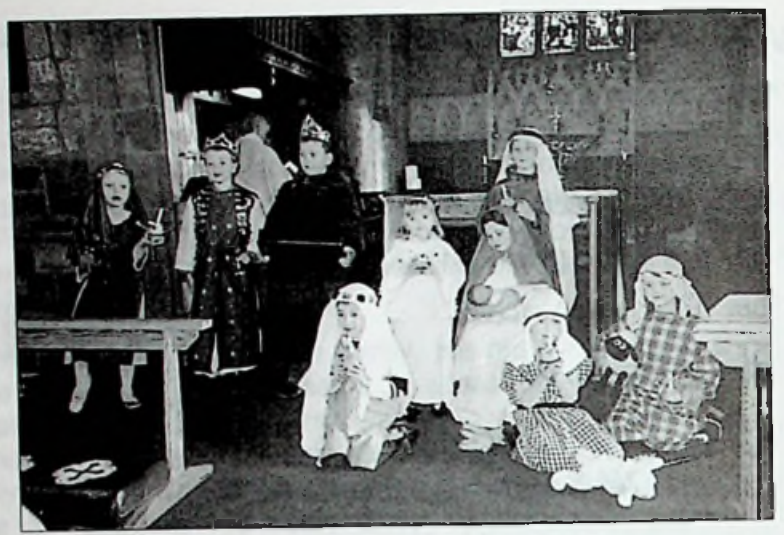
Nativity Tableau at Family Christingle Service