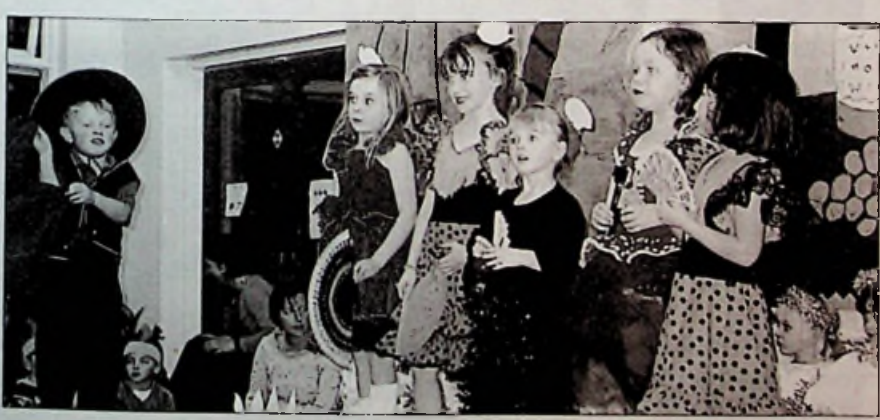
The Infant School perform "The Smallest Angel".