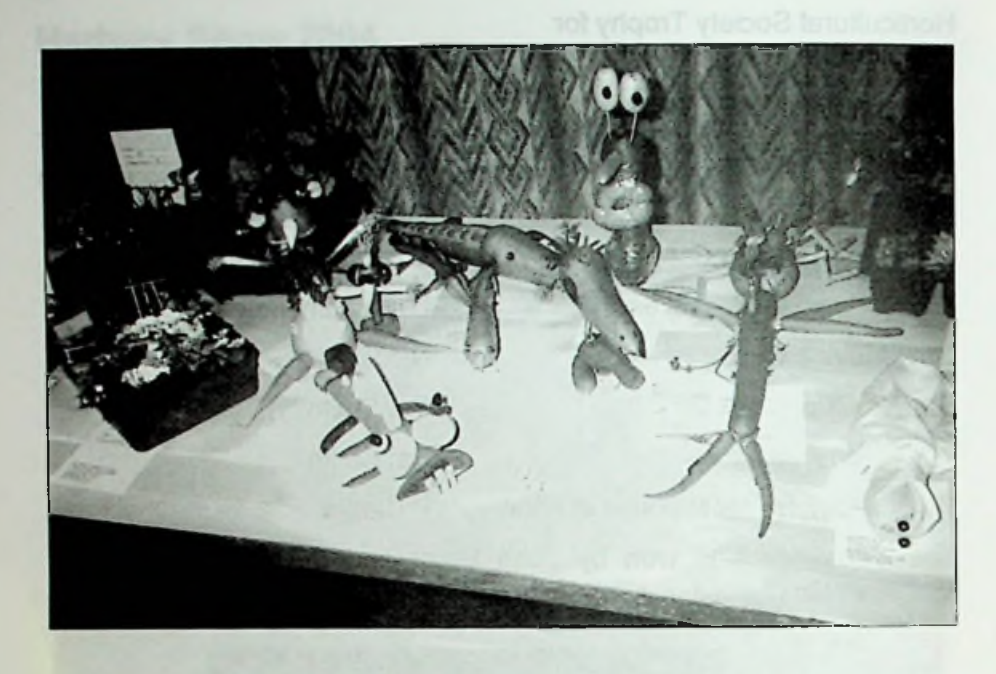
Children's Vegetable Display

As Show Secretary I would like to thank all the Judges, Stewards and helpers who made the day run smoothly. Thank you to all of the exhibitors and see you all again in 2005.