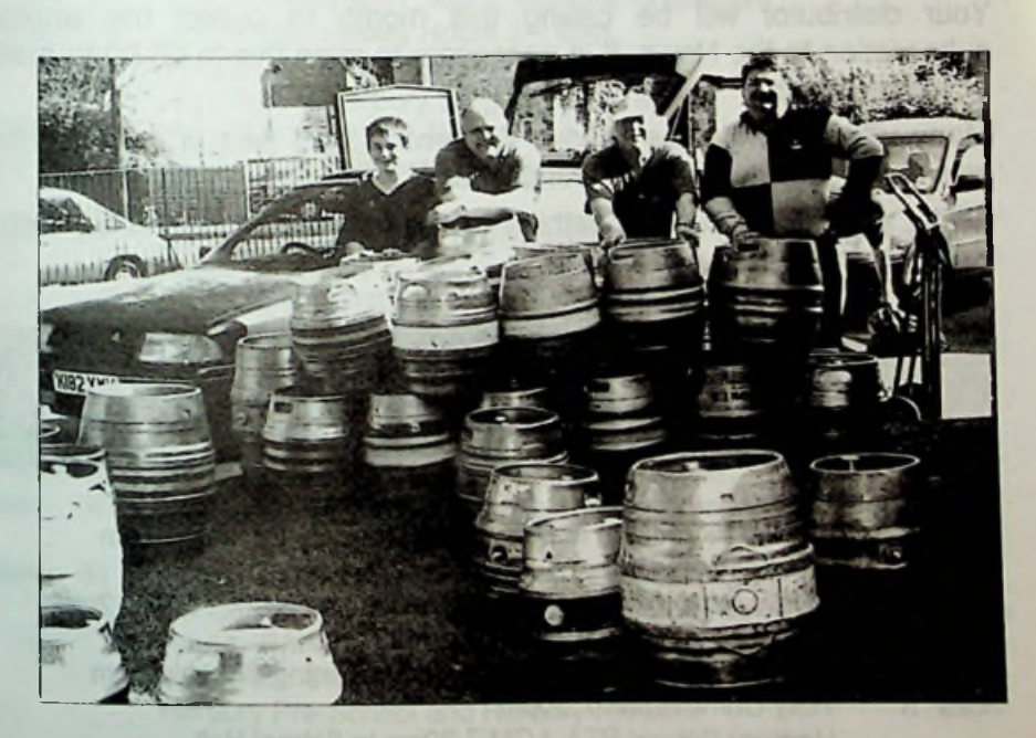
The Empties! - after another successful Beer Festival