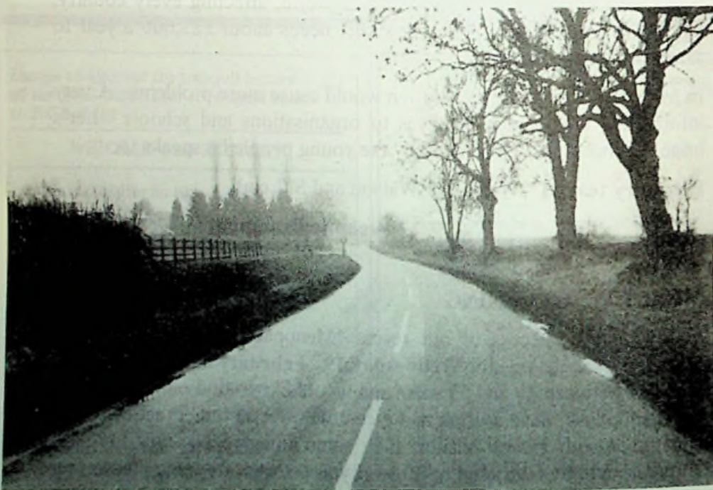
(The photos show the view looking towards Vicarage Lane before and after the removal of the hedge and young trees.)