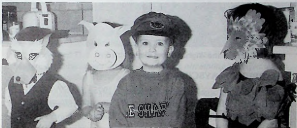
Jolly Christmas Postman by the Nursery Playgroup performed at the Village Hall.

In October we held an 80/20 Sale closely followed by our Annual Book Week. During the week we also held a successful coffee morning at the Village Hall, providing opportunities for everyone to view the many different activities on offer to the Playgroup children. The children ended term with a wonderful Christmas party and an hilarious rendition of The Jolly Christmas Postman . The performance was thoroughly enjoyed by all the parents - even if Humpty Dumpty's fall was somewhat unexpected!