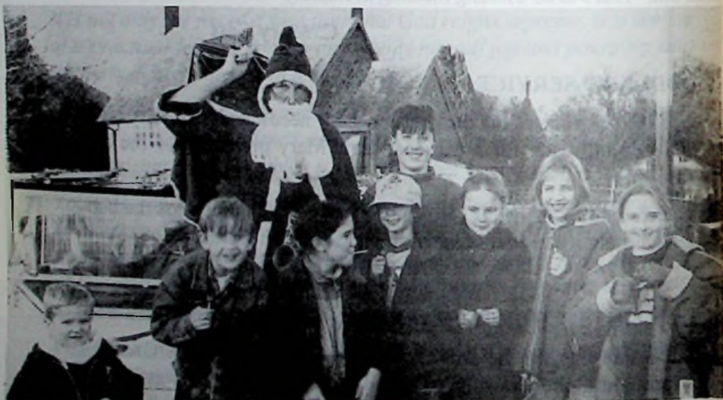
Father Christmas arriving at the Christmas Fair.