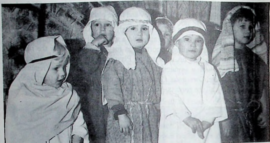
Nativity Play by the Wight School Playgroup