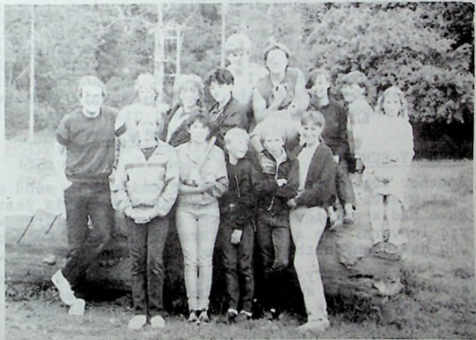
'Members resting after a game of rounders'