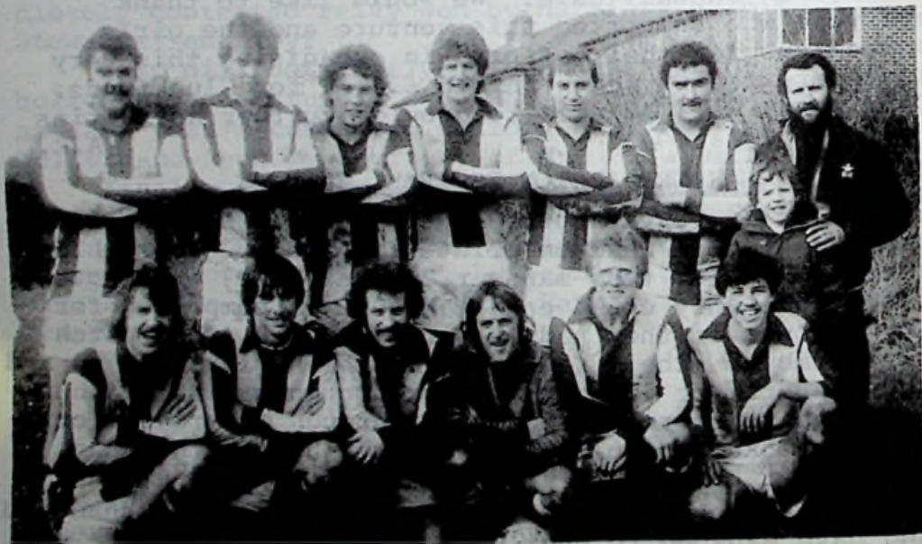
Harbury Albion 1st team after their 1-0 victory over Kenilworth Rangers.