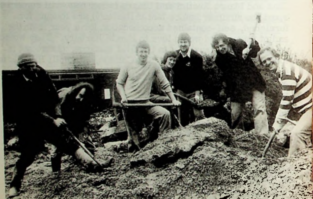
Rugby Club Members levelling the ground at their new Club House.