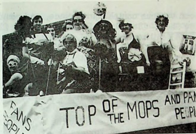
Left: "Can I do you now, sir?". The W.I. on their second-prize winning float.